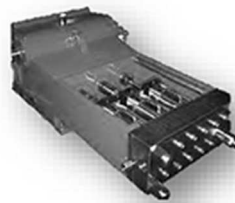
Triplex Plunger Pump